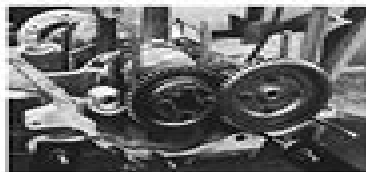
Figure 27. Installing Adapter Electric Bearing.