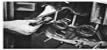
Figure 28. Installing Starter Pinion. Pinion Manual Starting Engines.