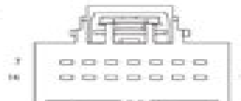
MODULE-TOTALLY INTEGRATED POWER C5