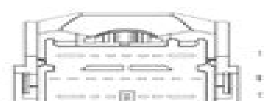
MODULE-TOTALLY INTEGRATED POWER C6