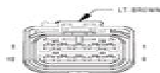
ASSEMBLY-TRANSMISSION SOLENOID (RLS)