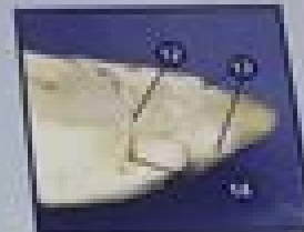
Examine the sex of the specimen.

Cut through the body wall where indicated by the blue dashed line below to expose the pharyngeal cavity. Then, cut along the path indicated by the red dashed line to expose the pericardial cavity.