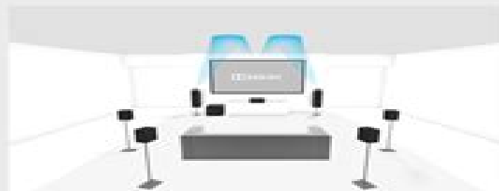
Perspective detail for 7.1.2 setup