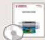
Printer Software and Driver CD