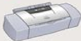
Canon i9100 Series Photo Printer