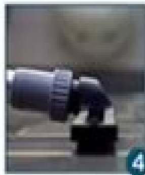
4 Vacuum up the solution.