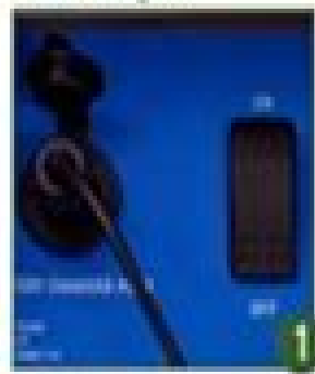
1 Clean, then charge the Cleaning Caddy.

⚠ WARNING: Do not spray electrical outlets, drywall or other sensitive surfaces.