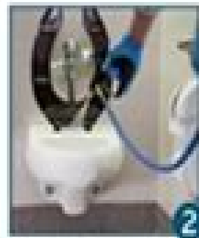
2 Spray toilets, urinals, fixtures, counters, sinks and faucets.