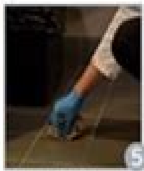
5 Pick up debris.