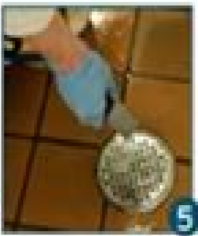
5 Empty wet-vacuum on the Cleaning Caddy.