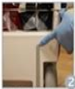
2 Check water and product levels.