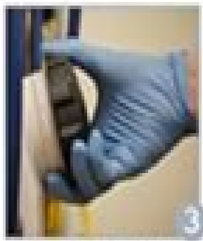
3 Fill water and replace product, if necessary.