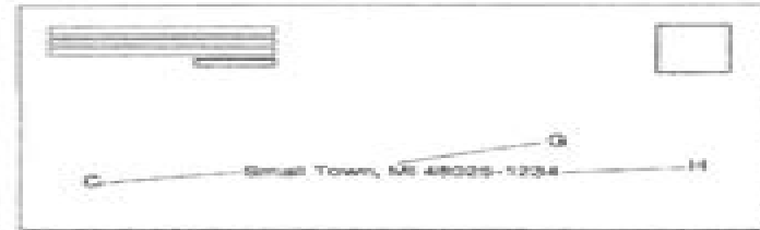
Addressed Envelope 2