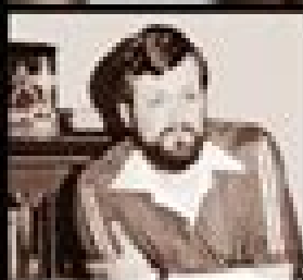
UFOs Revealed! Earth Says Say NASA Man The Australian Today, February 11, 1988, page 1