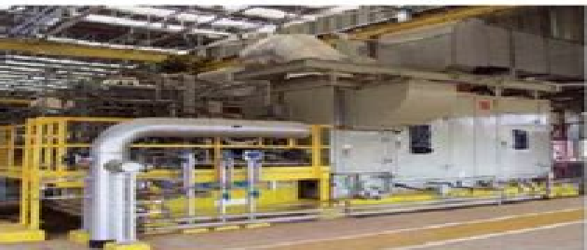
Figure 1: Cablunas Terminal - Onshore Gas Gathering Compressor Station.

The gas in a main transmission line is nominally clean and dry while that in gas gathering lines may contain liquids prior to processing, but in all cases there can be entrained liquids