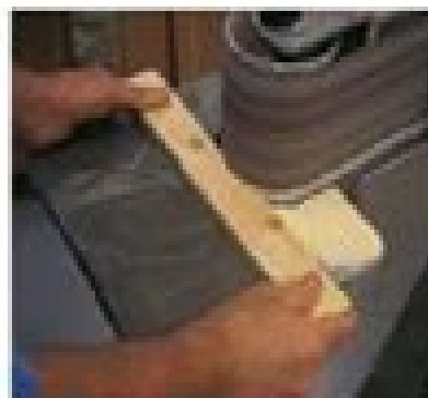
step 17 • Use a nail gun to attach the front door to the side of the back panel.