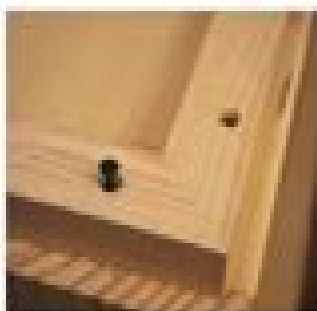
step 16 • Attach the front door to the bottom of the cabinet with a nail gun.