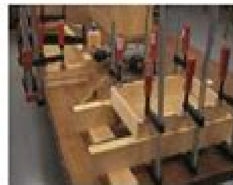
step 18 • Assemble the front door to the side of the back panel. Use a nail gun to attach the front door to the side of the back panel.