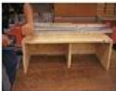
step 12 • Using a nail gun, attach the side of the back panel to the front panel.