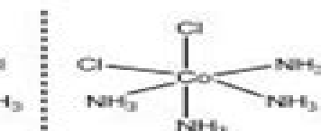
The mirror image of the cis isomer is also superimposable.

No; both the trans and the cis forms of \text{Co}(\text{NH}_3)_4\text{Cl}_2^+ have mirror images that are superimposable. For the cis form, the mirror image only needs a 90^\circ rotation to produce the original structure. Hence neither the trans nor cis form is optically active.