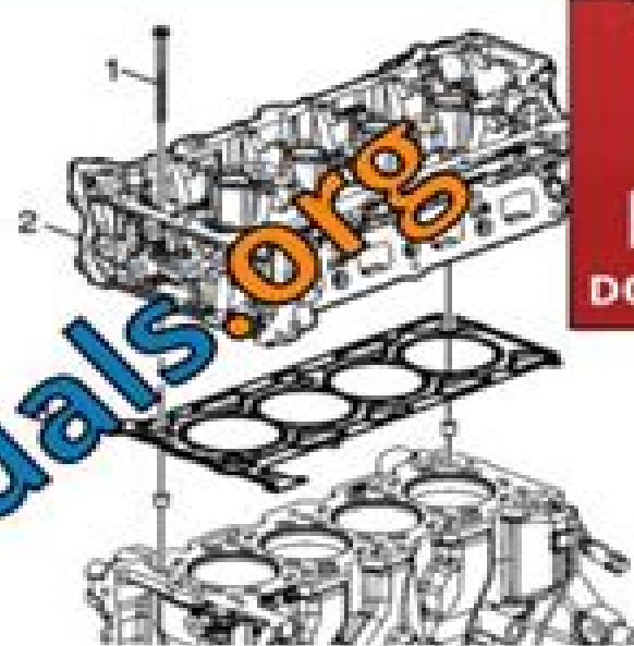
Fig. 75: Cylinder Head Bolts

Remove and discard the cylinder head bolts (1).