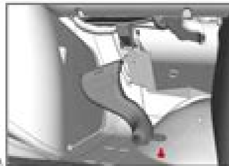
3. Install the right side floor front air outlet control panel (1). Floor Front Side Outlet Control Panel Replacement - Right Side