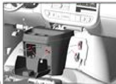
5. Front Floor Console Extension Panel (1) - Install - Front Floor Console Extension Panel Replacement