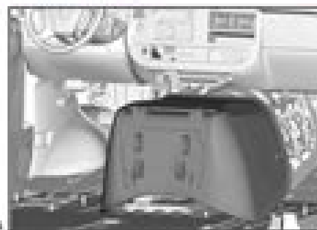
4. Engine Cover (1) - Install - Engine Cover Replacement