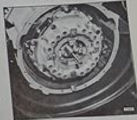
Figure 7—View of Clutch (Long and Back) (Lips-Bulbless Clutch)

4. Slide release bearing and support assembly on bearing cap to contact fingers of release yoke.