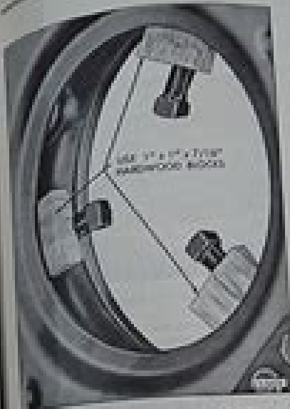
Figure 5—View of Clutch Between Release Lever and Cover (Long and Back)

IMPORTANT: An excessive amount of grease must be applied to release bearing and ball stud to bearing and damage other clutch components.