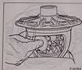
Figure 17—Installing the Pinion Gear