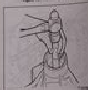
Figure 11—Assembling the Ring Gear