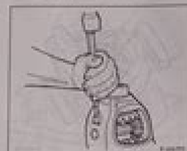
Figure 18—Installing the Lock Pin