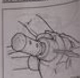
Figure 10—Assembling the Pinion