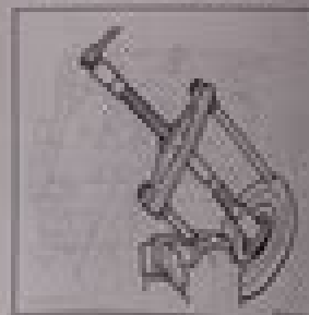
Figure 12—Assembling the Pinion and Ring Gear