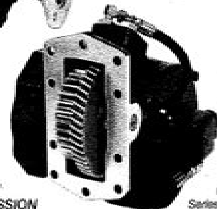
CS10 Series PTO

MUNCIE PTOs FOR THE ALLISON WORLD TRANSMISSION