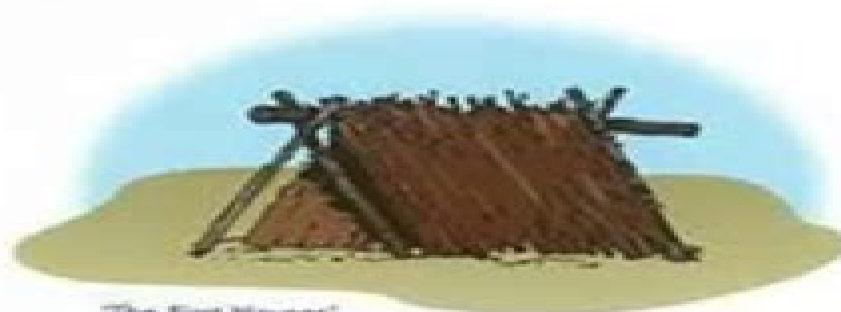
"The First Houses"