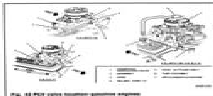
Fig. 43 PCV valve location—gasoline engine

The valve is either mounted on the valve cover or in the line which runs from the intake manifold to the crankcase. Do not attempt to adjust or repair the valve. If the valve is faulty, replace it.