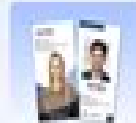
Photo Avatar Turn a photo into a talking avatar

Custom Avatar Create a personal avatar in minutes