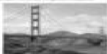
The Golden Gate Bridge

Read the selection and write the best answer to each question. Read the selection and write the best answer to each question. Read the selection and write the best answer to each question.