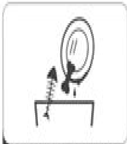
2 Removing the larger residue on the cutlery