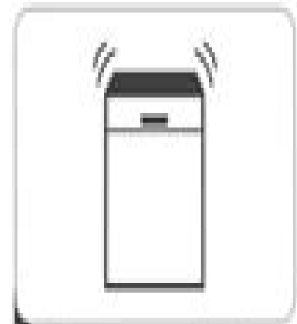
5 Selecting a program and running the dishwasher