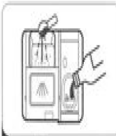
4 Filling the dispenser