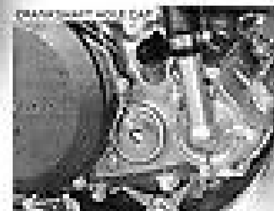
CRANKSHAFT HOLE CAP