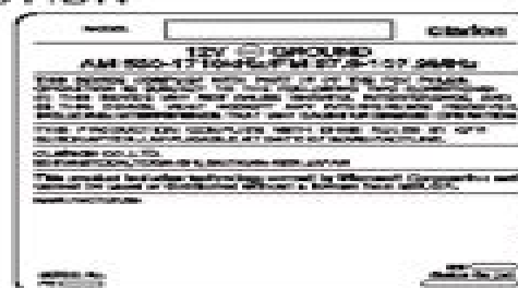
Bottom view of PE-2697B-A

Use of controls, adjustment, or performance of procedures other than those specified herein, may result in hazardous radiation exposure.