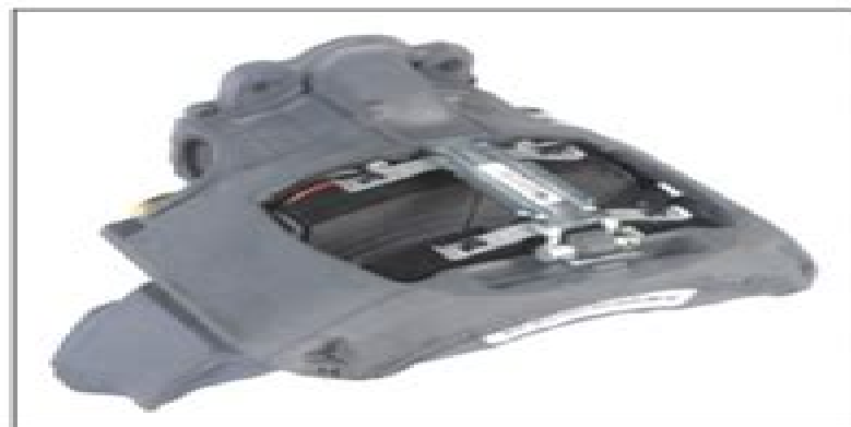
FIGURE 1 - BENDIX® ADB 22X™ AIR DISC BRAKE

When the vehicle brakes are released, the air pressure in the service brake chamber is exhausted and the return springs in the chamber and the bridge return the air disc brake to a neutral, non-braked position. To maintain the running clearance gap between the rotor and the brake pads over time, the non-braked position is mechanically adjusted by a mechanism in the caliper. The adjustment mechanism operates automatically whenever the brakes are activated, to compensate for rotor and brake pad wear and to keep the running clearance constant. During pad and rotor maintenance, the technician manually sets the system's initial non-braked position. The total running clearance (sum of clearances on both sides of the rotor) should be between 0.024 to 0.043 in. (0.6 and 1.1 mm).