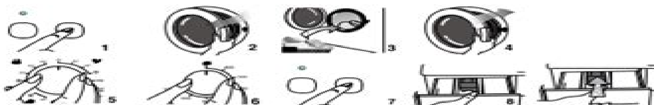
Program selection table

related to selected program. If you are using auxiliary function press desired auxiliary function key. Afterwards place appropriate detergent and softener to your machine's detergent drawer. Start your machine by pressing Start/Pause/Cancel button. Start/Pause/Cancel key's led will be on. After your machine starts, you can follow from the program progress display at which step your machine is.