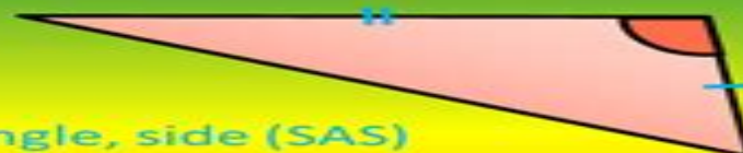
Side, angle, side (SAS)