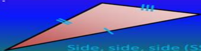
Side, side, side (SSS)