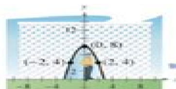
Figure for 98