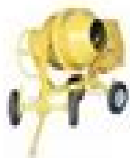
CONCRETE MIXER MACHINE