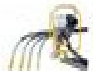
VIBRATOR & NEEDLE