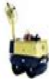
WALK BEHIND ROLLER