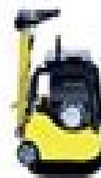
REVERSIBLE PLATE COMPACTOR