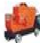
BAR CUTTING MACHINE