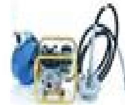
SUBMERSIBLE FLEXIBLE SHAFT PUMP