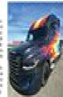
Michelin designed the tire for the future fleet's needs.

Michelin is investing heavily in research and development to create a more efficient fleet future.