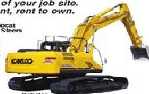
Kobelco Crawler Excavators