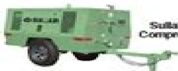
Sullair Air Compressors