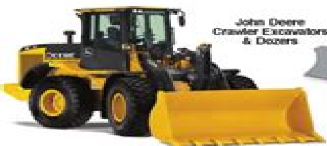
John Deere Crawler Excavators & Dozers

Our fleet of trucks will deliver and pick up to meet the demands of your job site. Rental plans to fit your project, short term, long term, rent to rent, rent to own.