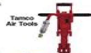
Tanco Air Tools