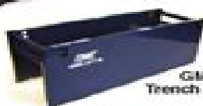
GME Trench Boxes