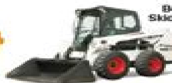
Bobcat Skid Steers