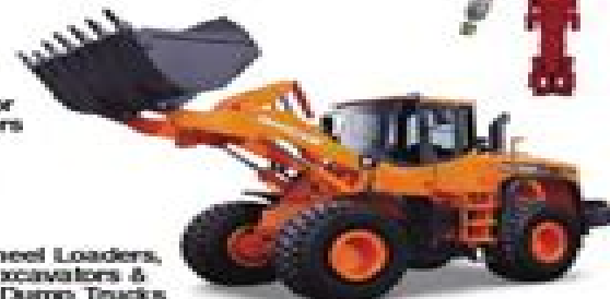
Doosan Wheel Loaders, Crawler Excavators & Articulated Dump Trucks