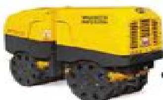
Wacker Neuson Compactors