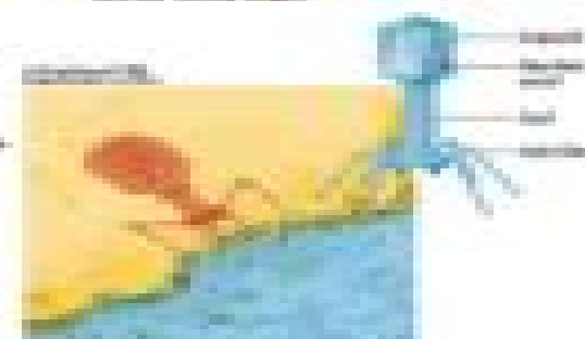
Figure 18.14 The following virus structure shows a virus with a tail and a tail sheath.