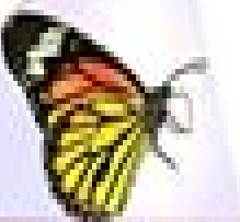
Image after enlargement