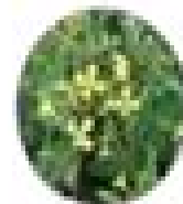
Mustard, wild Sinapis arvensis

Young leaves are egg-shaped, arranged in a basal rosette