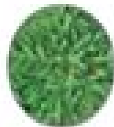
Cynodgrass, smooth Elymus canadensis

Leaves are blade-like and rolled, up to 30 inches long with distinct midrib