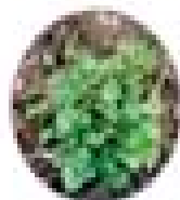
Bittercress, hairy Cardamine hirsuta

Spreading, alternating, elliptic to lance-shaped leaves