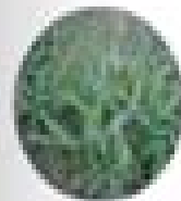
Foxtail, yellow Setaria viridis

Narrow, linear-shaped leaves with short sheaths