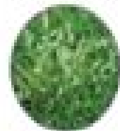
Annual Bluegrass Poa annua

Smooth, yellow-green leaf blades with pointed or boat-shaped tips