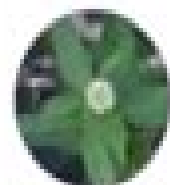
Eklipse Eclipta prostrata

Dark green, alternating, egg-shaped leaves