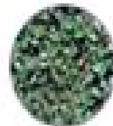
Purslane, common Portulaca oleraceus

Leaves are smooth and originate from a basal rosette; narrow, fleshy, elongated