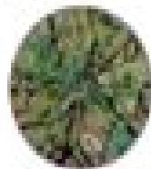
Barnyardgrass, common Echinochloa crus-galli

Smooth, yellow-green leaf blades with pointed or boat-shaped tips