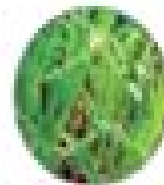
Kyllinga, green Kyllinga brevifolia

Leaves have long whip-like hairs on upper surface