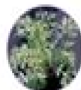
Parthenium Parthenium hysterophorus

Leaves are oval-shaped, alternate, with stiff, bristly hairs on upper surface