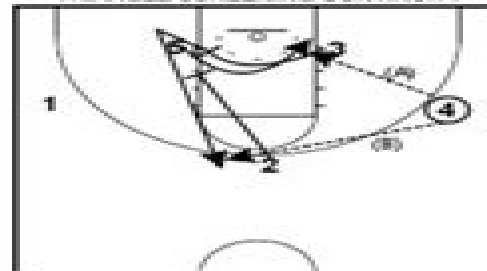
TRIANGLE SCREENING CONTINUITY

TRIANGLE SCREENING CONTINUITY: Same continuity - scoring options are the same: (A) low post, (B) cutter to the top for jumper or 3pt shot.