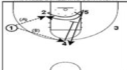
TRIANGLE SCREENING CONTINUITY

TRIANGLE SCREENING CONTINUITY: As soon as the ball is reversed to the wing (1), 2 crosses-screens 5 (make 5 cut over top of screen). As soon as 5 is on 2's hip, 4 downscreens hard - headhunt for 2's defender - to free 2 up in the top. Scoring options: (A) low post, (B) 3pt shot or jump shot at top.