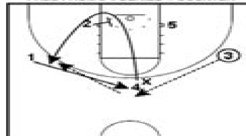
PASS FROM 3-4 DENIED - COUNTER

4 DENIED AT THE TOP: 4 immediately cuts backdoor - if not open, she cuts off of a short downscreen by 2 to the offside wing. 1 pops hand to the top - 3 passes to 1, who reverses to 4 cutting off of 2's screen.