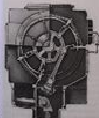
The Watt parallel motion linkage, which was used to convert the circular motion of a crank into a straight-line motion.

The engine was built in 1712, and it was the first to use steam power to do work. It was built for a mine in Devon, England, and it was used to pump water out of the mine. The engine was built by Thomas Newcomen, who was a partner in the mine.