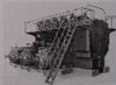
The Watt parallel motion linkage was used to convert the circular motion of a crank into a straight-line motion. It was built by James Watt in 1784.