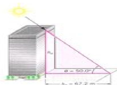
Figure 1.6 From a value for the angle \theta and the length h_a of the shadow, the height h_o of the building can be found using trigonometry.