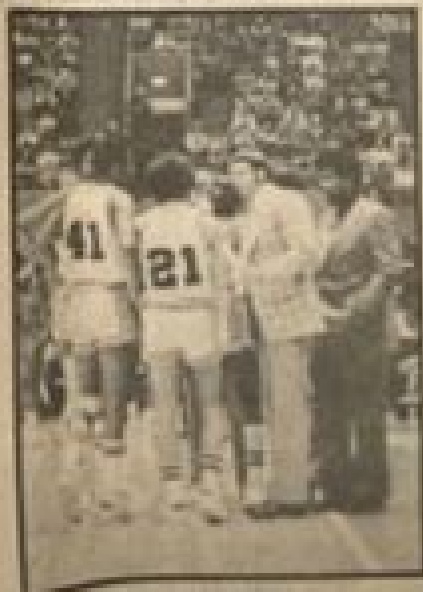
1994. Journal of the American Academy of Child and Adolescent Psychiatry 33: 100-108.