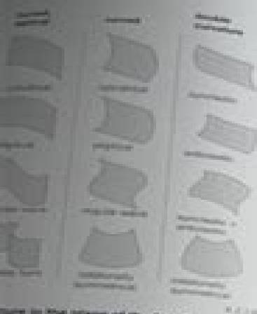
Figure 4.2.1.6: Facade in the plane of the facade