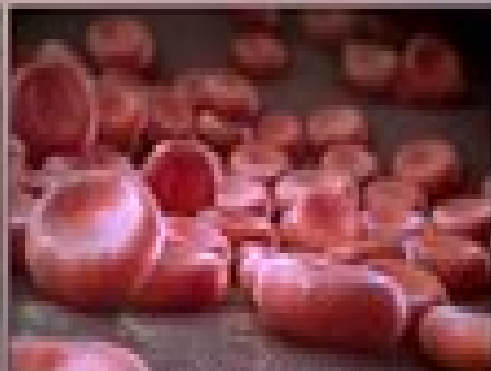
Hemolytic Anemia Lupus Erythematosus