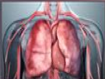
Fibromyalgia Wegner's Granulomatosis