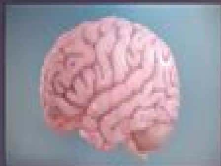
Multiple Sclerosis Guillain-Barre Syndrome