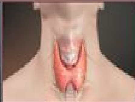
Thyroiditis Hashimoto's Disease Graves Disease