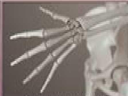
Rheumatoid Arthritis Ankylosing Spondylitis Polymyalgia Rheumatica