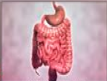
Celiac's Disease Crohn's Disease Ulcerative Colitis Type 1 Diabetes