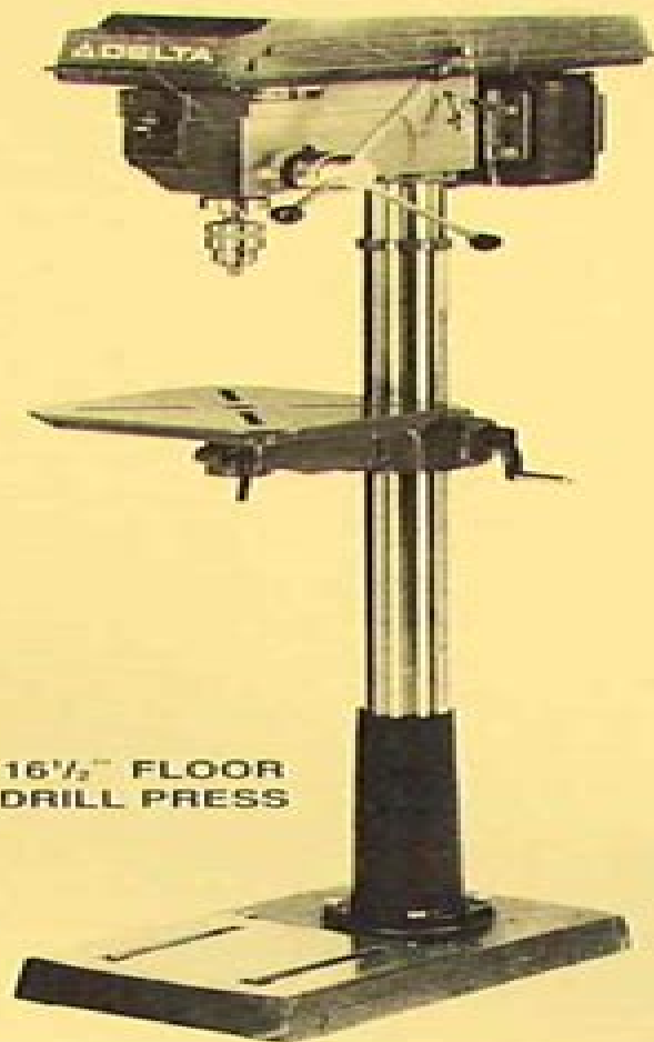
16 1/2" FLOOR DRILL PRESS