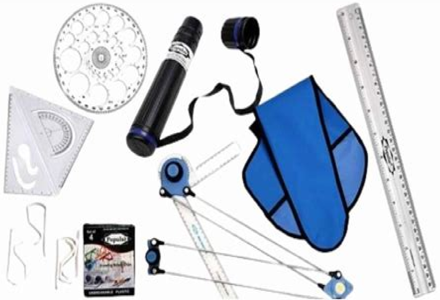
15 Engineering Drawing Instruments