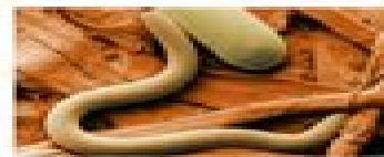
Nematode: Pteronotus glyceris