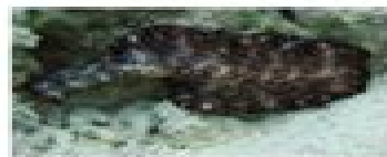
Flatworm: Pseudoberoa testudin