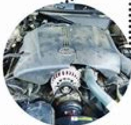
Issues with sensors found throughout the engine