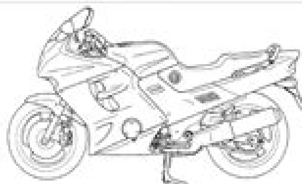
(1) FRAME SERIAL NUMBER