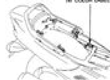
(4) COLOR LABEL

(4) The color label is attached as shown. When ordering color-coded parts, always specify the designated color.