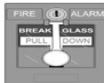
Figure 1: A4099-5213 single action manual station (front and side view)

Station testing Pull the lever to test the station. Electrical testing is performed by unlocking the station housing to activate the alarm switch.