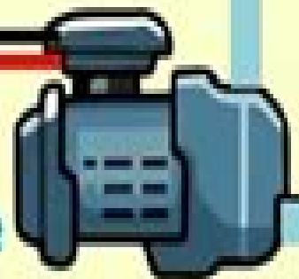
Single Phase 1HP Motor