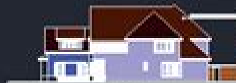
EASTMAN HOUSE WEST ELEVATION