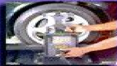
Suspension and Steering