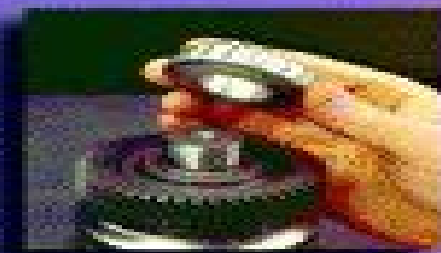
Automatic Transmissions and Transaxles