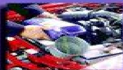
Heating and Air Conditioning Systems