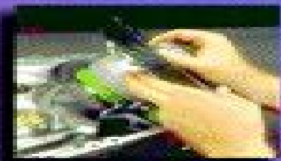
Manual Drive Shafts and Axles