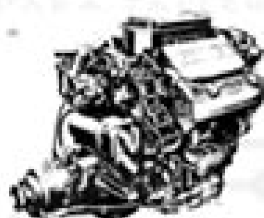
Special Service Manual 4-53