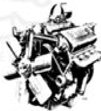
Special Service Manual 8V-53