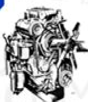
Special Service Manual 2-53