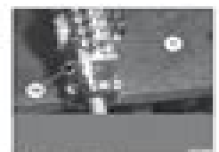
Fig. 7: Governor assembly